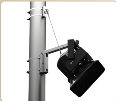
SINGLE LOUDSPEAKER INSTALLATION FOR 2-3/8" POLES AND LARGER

INSTALLERS TAKE NOTE: Always secure mounted objects to the mounting structure with safety cables.