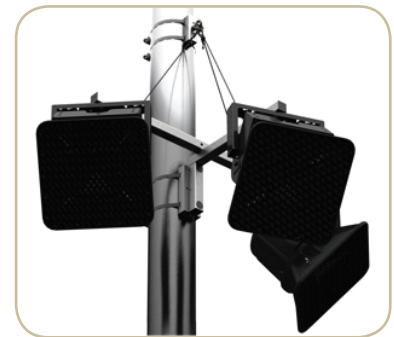
THREE LOUDSPEAKER INSTALLATION FOR 6" DIAMETER POLES & LARGER

This type of installation assumes that the pole is 6" in diameter or larger and the speakers come with their own yoke style mounting arms. This installation requires a dual adapter arm, the larger pole adapter and a band kit. When an adequate anchor point is not available, include the safety anchor. Each of these components are all-weather rated and come with the required assembly hardware. If a yoke arm is not supplied with the selected loudspeakers, contact us at custserv@allenproducts.com