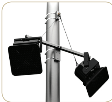
DUAL LOUDSPEAKER INSTALLATION FOR 6" DIAMETER POLES & LARGER

This type of installation assumes that the selected loudspeaker come with its own yoke style mounting arm. The installation then further requires a Support Arm, a Pole Adapter and a Band Kit. Each of these components is constructed of stainless steel material and come with the required assembly hardware. If a yoke arm is not supplied with the selected loudspeaker, contact us at custserv@allenproducts.com